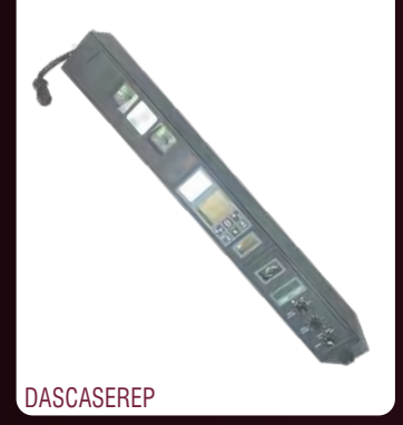
Case International Harvester