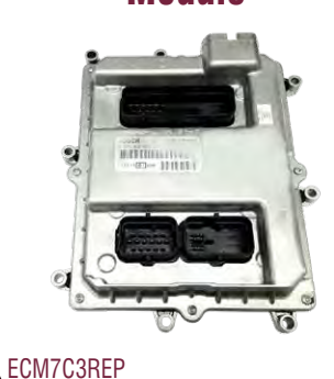
MAN TGA (2007 on)