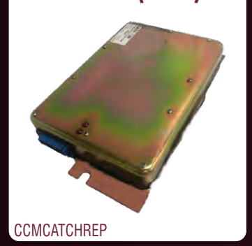
Caterpillar Challenger 35, 45 and 55 series